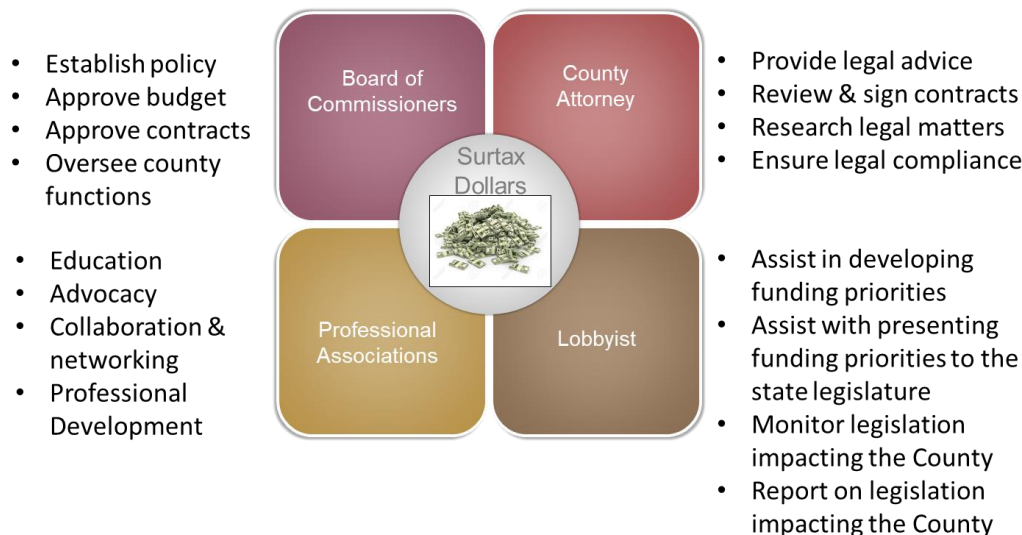
FIGURE 6-2 COUNTY'S LEGAL INFRASTRUCTURE