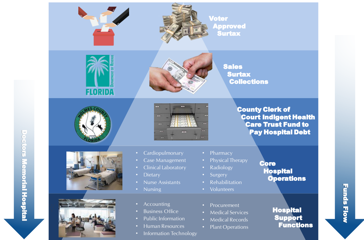
FIGURE 1 INDIGENT CARE SALES SURTAX FLOW OF FUNDS

Figure 1 illustrates the surtax funds flow and the relationship between the two (2) levels of review. It also identifies the Clerk of Court's role and the Hospital's core operations and support functions.